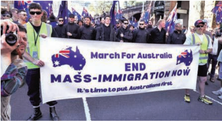
Demonstrators during the 'March for Australia' anti-immigration rally, in Sydney on Sunday

A Department of Foreign Affairs and Trade study published in March 2022, Australia's Indian Diaspora: A National Asset, drew on the 2016 Census to note that 675,658 people then claimed Indian ancestry, representing 2.8 per cent of the national