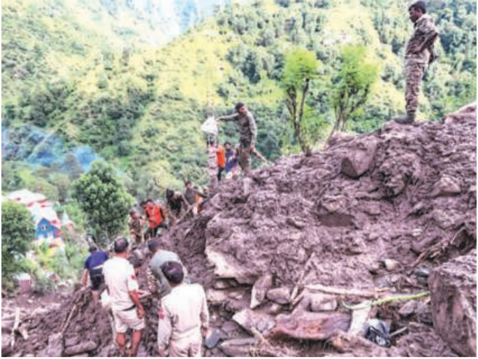
Rescue operation being carried out after cloudburst and heavy rainfall hit Ramban district in Jammu & Kashmir