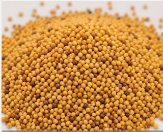
Seeds & Traits