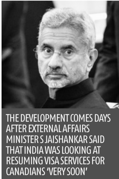
THE DEVELOPMENT COMES DAYS AFTER EXTERNAL AFFAIRS MINISTER S JAISHANKAR SAID THAT INDIA WAS LOOKING AT RESUMING VISA SERVICES FOR CANADIANS 'VERY SOON'

The ties between India and Canada nosedived after Canadian Prime Minister Justin Trudeau alleged on September 18 that there was a potential link between Indian agents and the killing of Khalistani separatist Hardeep