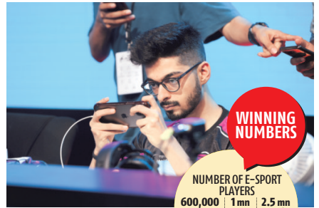
Gamers at the BGMI Masters Series 2023, held in Chhatrapur, Delhi. A 25-day event that began on August 4, it drew 119 players divided into 24 teams