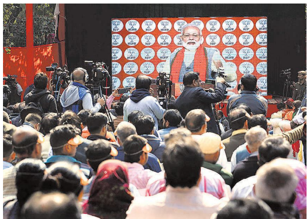
Prime Minister Narendra Modi addresses BJP workers via video conference in New Delhi on Thursday

"Pehle filme banti thi ki bharat me kaise attack hue. Ab filme banti hain ki bharat me kaise un attacks ka muh tod jawab diya (Earlier, they made films on how India was attacked. Now, they make films on how India gives a be-