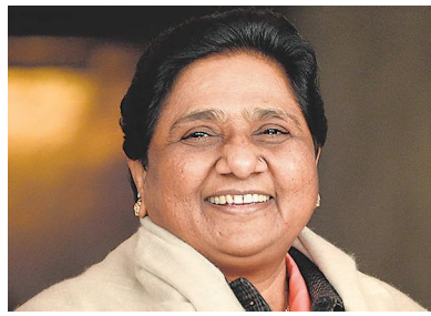
BSP chief Mayawati

Former Uttar Pradesh chief minister Akhilesh Yadav said even the BJP supporters are ashamed of Modi's actions.