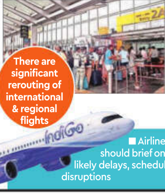
There are significant rerouting of international & regional flights

Information must be communicated at check-in, boarding gates