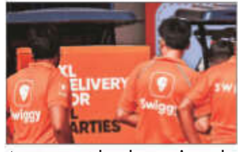
Agreement has been signed to onboard cooperative dairy on the e-commerce platform

Under the agreement, products under Bharat Organics and other cooperative dairy products will be available on Swiggy's