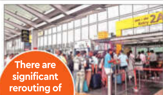
There are significant rerouting of international & regional flights

■ Advisory focuses on pre-flight passenger communication, in-flight catering and comfort ■ Also include medical preparedness, customer service, intra-departmental coordination