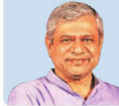
Ashwini Vaishnaw, Union Minister

"My last and final point is, please achieve Six Sigma quality in everything that you do. Nothing less than Six Sigma will be tolerated. We will be evaluating your progress, not just on the manufacturing volume, but also on the quality that you produce," Vaishnaw said.