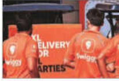
Agreement has been signed to onboard cooperative dairy on the e-commerce platform

The partnership aims to support cooperative brands in marketing, promotion, consumer technology and capacity building, according to the ministry. "The collaboration comes as the UN has declared 2025 as the International Year of Cooperation, with Swiggy and the ministry planning an awareness campaign to promote cooperative movements nationwide.