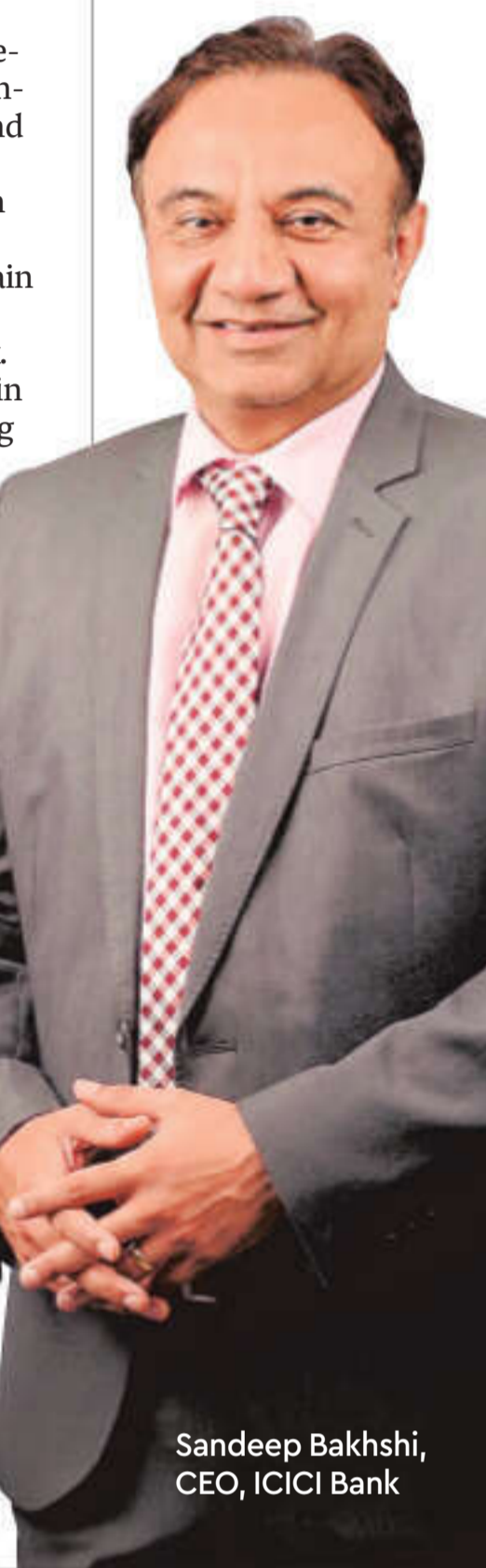
Sandeep Bakhshi, CEO, ICICI Bank

THE BANK WANTS TO SCALE RAPIDLY WHILE BUILDING COMPETITIVE ADVANTAGES THAT ARE HARDER TO REPLICATE THAN A RATE CUT OR A MARKETING CAMPAIGN