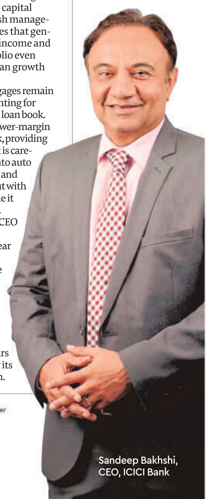
Sandeep Bakhshi, CEO, ICICI Bank

THE BANK WANTS TO SCALE RAPIDLY WHILE BUILDING COMPETITIVE ADVANTAGES THAT ARE HARDER TO REPLICATE THAN A RATE CUT OR A MARKETING CAMPAIGN