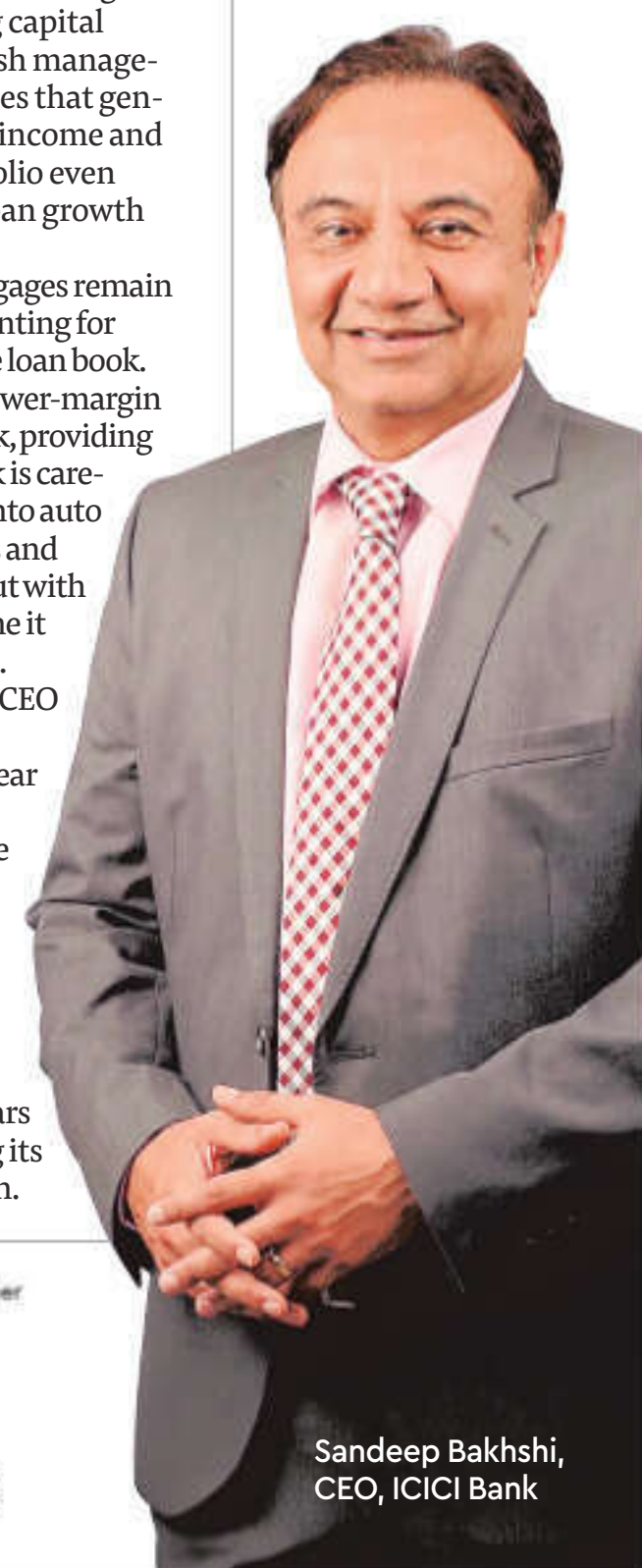
Sandeep Bakhshi, CEO, ICICI Bank

THE BANK WANTS TO SCALE RAPIDLY WHILE BUILDING COMPETITIVE ADVANTAGES THAT ARE HARDER TO REPLICATE THAN A RATE CUT OR A MARKETING CAMPAIGN