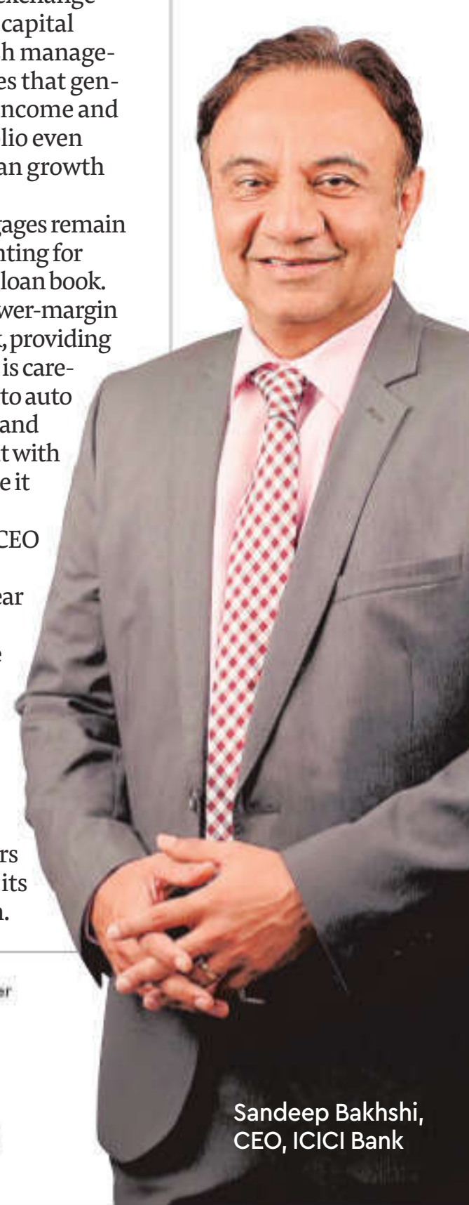
Sandeep Bakhshi, CEO, ICICI Bank

THE BANK WANTS TO SCALE RAPIDLY WHILE BUILDING COMPETITIVE ADVANTAGES THAT ARE HARDER TO REPLICATE THAN A RATE CUT OR A MARKETING CAMPAIGN