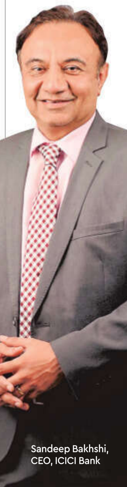
Sandeep Bakhshi, CEO, ICICI Bank

THE BANK WANTS TO SCALE RAPIDLY WHILE BUILDING COMPETITIVE ADVANTAGES THAT ARE HARDER TO REPLICATE THAN A RATE CUT OR A MARKETING CAMPAIGN