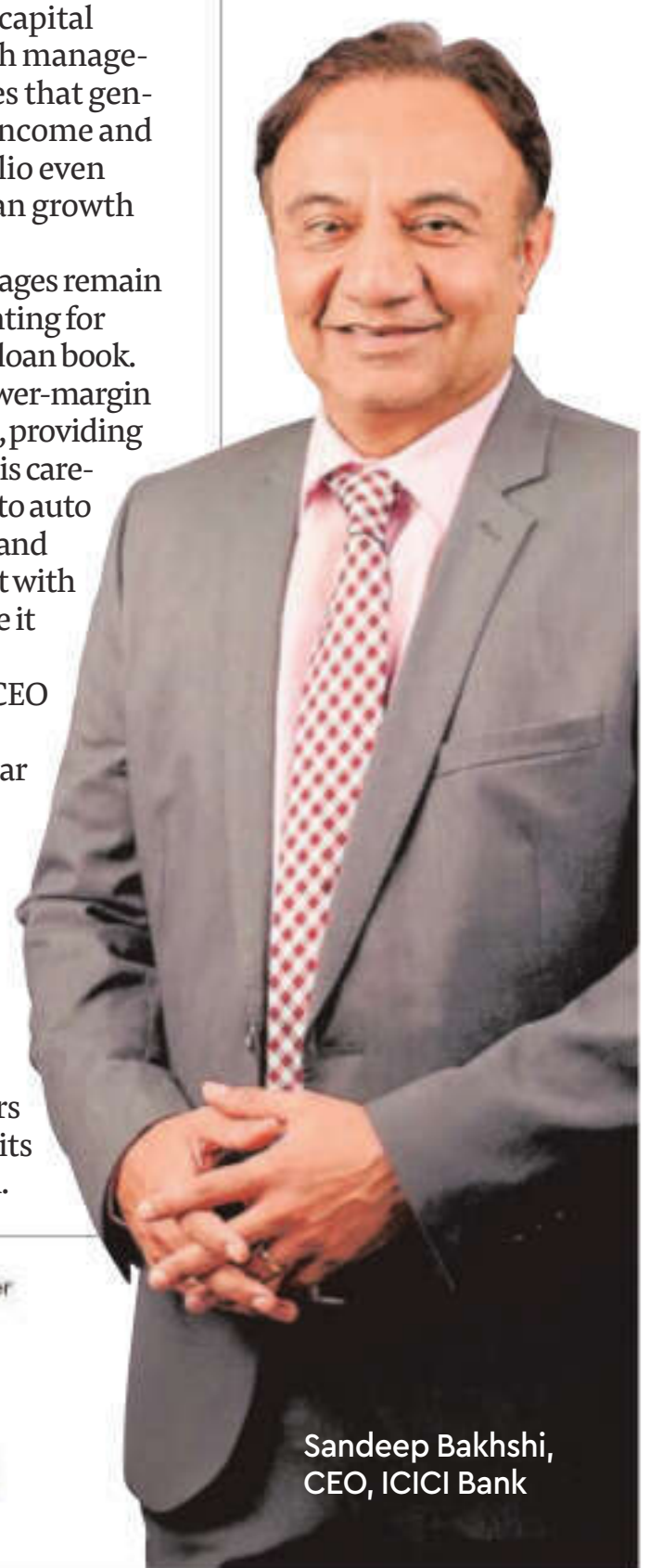
Sandeep Bakhshi, CEO, ICICI Bank

THE BANK WANTS TO SCALE RAPIDLY WHILE BUILDING COMPETITIVE ADVANTAGES THAT ARE HARDER TO REPLICATE THAN A RATE CUT OR A MARKETING CAMPAIGN