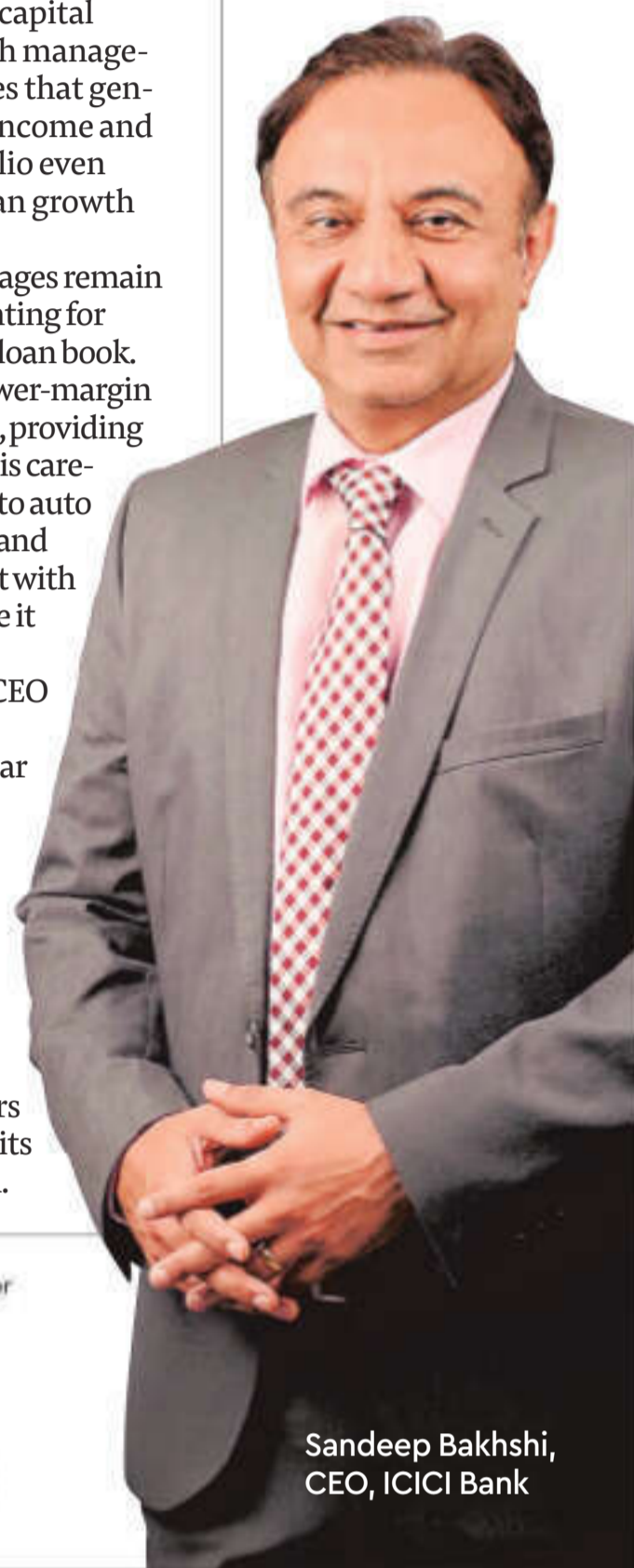
Sandeep Bakhshi, CEO, ICICI Bank

exports—yet they receive only 12-13% of formal credit. That gap has long existed because lending to smaller businesses was considered too risky, too opaque, too difficult to assess. ICICI Bank has used GST data analytics and deeper credit bureau insights to change that calculus, opening up a segment that was previously off-limits for much of the formal banking system. Its digital platform InstaBIZ has further accelerated this push, giving businesses faster, more seamless access to banking services. What distinguishes the bank's approach here isn't just the technology—it's the philosophy behind it. Rather than selling individual products to MSME customers, ICICI Bank aims to serve their entire financial life. The result is stronger relationships, better cross-selling opportunities and fee income that add resilience to the overall business model. Business banking carries higher risk than lending to large corporates, and ICICI Bank is clear-eyed about that. But it also offers better yields and richer fee income—provided the underwriting is