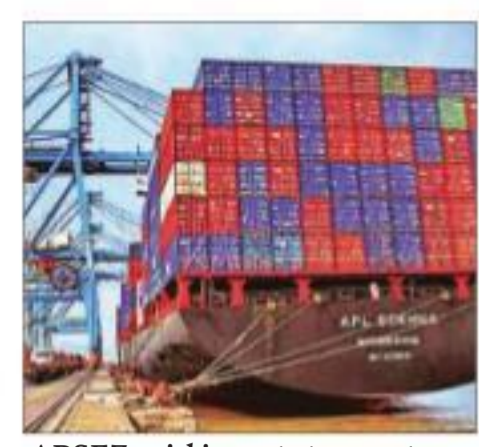
APSEZ said in a statement. This would enable APSEZ to service customers in Maharashtra which includes the highly industrial areas and development in the Mumbai and Pune regions, it said. "APSEZ plans to invest over ₹10,000 crore to develop the port into a multi-cargo port with world class infrastructure as well as investing in the development of rail & road evacuation infrastructure for seamless and efficient cargo movement," the statement said. The company will strengthen and repair existing infrastructure and invest in development of facilities for dry, container, and liquid cargo. "DPL will evolve as an alternative gateway to JNPT and will invite and support the devel-

PRESS TRUST OF INDIA New Delhi, February 16 ADANI PORTS AND Special Economic Zone (APSEZ) on Tuesday said it has completed the acquisition of Dighi Port for ₹705 crore and would invest over ₹10,000 crore in developing it as an alternate gateway to JNPT. JNPT is India's largest container port and is one of the 12 major ports in the country. "APSEZ completed the acquisition of 100% DPL for ₹705 crore on February 15, 2021....DPL, the 12th port to join APSEZ's string of economic gateways across the eastern and western coast of India would establish the company's footprint in Maharashtra, the largest contributor to India's GDP,"