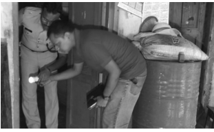
Forensic expert examining and collecting samples from Ramnagar village in Malda where a baby was shot at following panchay board formation on Thursday