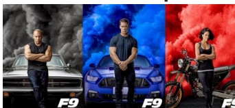
Ahmedabad, The ninth instalment in the Fast and Furious franchise, Fast9, will now be released in the cinemas on 3rd September 2021. The film will be released in English, Hindi, Tamil, Telugu and Kannada languages. With Fast and Furious 9, The Fast family is back for more high-octane thrills and insane vehicular madness, all wrapped up with colourful characters and exotic locations from around the world. In the upcoming film, we see Vin Diesel's Dominic Toretto and Michelle Rodriguez's Letty are content with a quiet family life completely off the grid with young Brian. Until that is, they get drawn back into a world filled with danger and action, this time facing a dangerous threat, one that resurfaces old wounds for Dom in particular. Fast and Furious 9 is directed by Justin Lin, who also co-wrote the screenplay with Daniel Casey. It is the sequel to The Fate of the Furious (2017), the ninth main instalment, and the tenth full-length feature to release overall in the Fast & Furious franchise. Besides Vin Diesel, Michelle Rodriguez, Tyrese Gibson, Jordana Brewster, Chris Bridges (aka Ludacris), Nathalie Emmanuel, Helen Mirren and Charlize Theron will reprise their roles. As far as the fresh faces go, Jaice Carter joins Cardi B and Ozuna to add up to the star-studded line-up. (19-8)