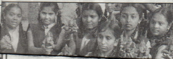
Place: Kolkata Date: 30th August, 2016

"The privacy policy stark contrast to the Privacy Policy existing from June 2012. In its first revised version on August 25, 2012, Respondents (WhatsApp, Facebook Inc. And Facebook India Online Pvt Ltd) introduced this policy which severely compromise the rights of its users and the privacy rights of its completely vulnerable users, it is alleged.