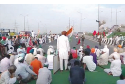
Khas cut near Kabutar Market. The farm leaders have appealed to all Indians to join

Traffic has been affected after agitating farmers blocked border areas in Delhi and national highways in Haryana as the Bharat Bandh began on Monday.