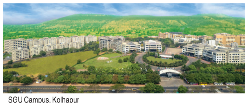
SGU Campus, Kolhapur

uled (charter) flight services across India. Their endeavour is to Connect Real India by providing passengers world-class flight services and comfort at an affordable price. Star Air operates under the popular UDAN-Regional Connectivity Scheme pioneered by the Ministry of Civil Aviation, Government of India.