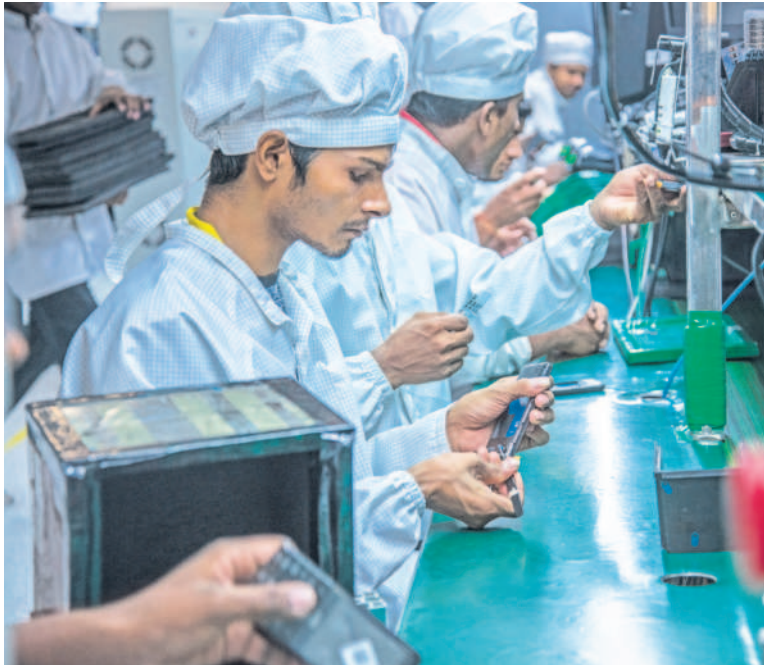
Industry estimates point to a single-digit fall this calendar year from 152 million smartphones shipped last year.

In FY26, Syrma SGS reported an operating margin of 7.1%, up 2.3 percentage points. Consumer electronics, which represented 30% or the largest chunk of Syrma's revenue of ₹4,819 crore, recorded the slowest growth