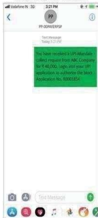
Block request SMS to investor