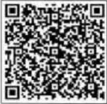
(Please scan the QR code to view the RHP)

THIS IS A PUBLIC ANNOUNCEMENT FOR INFORMATION PURPOSES ONLY AND IS NOT A PROSPECTUS ANNOUNCEMENT AND DOES NOT CONSTITUTE AN INVITATION OR OFFER TO ACQUIRE, PURCHASE OR SUBSCRIBE TO SECURITIES. NOT FOR RELEASE, PUBLICATION OR DISTRIBUTION DIRECTLY OR INDIRECTLY, OUTSIDE INDIA. Initial public offer of equity shares on the main board of BSE Limited ("BSE") and National Stock Exchange of India Limited ("NSE", and together with BSE, the "Stock Exchanges") in compliance with Chapter II of the Securities and Exchange Board of India (Issue of Capital and Disclosure Requirements) Regulations, 2018, as amended ("SEBI ICDR Regulations").