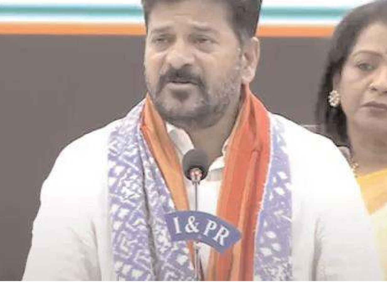
కేసీఆర్ అసెంబ్లీకి వచ్చి ప్రభుత్వాన్ని ఇరుకున పెట్టాలి. అవసరమైన సూచనలు చేయాలి” అని సీఎం రేవంత్ రెడ్డి పేర్కొన్నారు.

లో 4.50 లక్షల ఇళ్ల నిర్మాణానికి పరిపాలన అనుమతులు ఇస్తామన్నారు. ప్రతి నియోజకవర్గంలో 3,500 ఇందిరమ్మ ఇళ్లు నిర్మిస్తామన్నారు. తొలిదశలో అత్యంత పేదలకే మొదటి ప్రాధాన్యం ఉంటుందన్న సుస్థం చేశారు. తొలిదశలో ఎస్సీలు, ఎస్టీలు, త్రాన్స్జెండర్లు, అత్యంత పేదలకు ప్రాధాన్యం ఇస్తామని సీఎం రేవంత్ రెడ్డి పేర్కొన్నారు. ప్రభుత్వానికి విజ్ఞప్తు సూచనలు ఇచ్చే సందర్భానంత గతంలో ఉండేదని ఈ సందర్భంగా సీఎం గుర్తుచేశారు. ఆ సందర్భాయాన్ని ఇప్పుడు దెబ్బతీస్తున్నారన్నారు. పాలక, ప్రతిపక్షాలు శత్రుపక్షాలు అన్నట్లు వ్యవహరిస్తున్నారని అన్నారు. పాలక, ప్రతిపక్షాలు కలిస్తేనే ప్రభుత్వమని చెప్పుకొచ్చారు. అసెంబ్లీలో ఇరుపక్షాలకు సమాన ప్రాధాన్యం ఉంటుందన్నారు. పెద్దమనిషిగా కేసీఆర్ సూచనలు చేయాలని హితవుపలికారు. “మాకేమీ భేషజాలు లేవు.. పాలక పక్షాన్ని ప్రశ్నించండి.