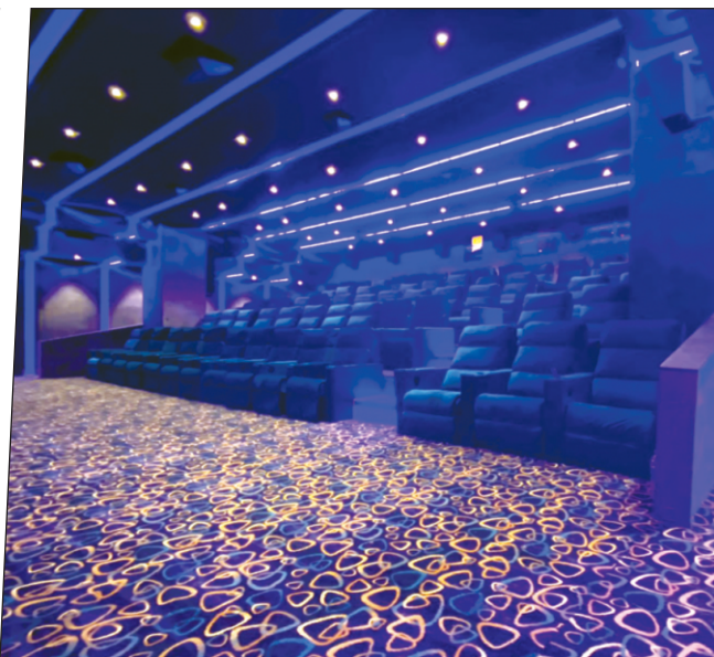
Sin City, Mumbai, Maharashtra, India.