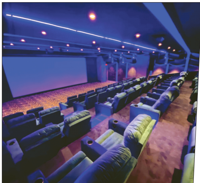
Red Bulb Studios, Mumbai, Maharashtra, India.