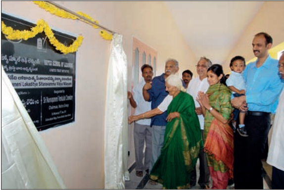
Natco school of learning inauguration