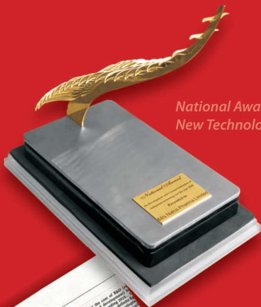
National Award for New Technologies