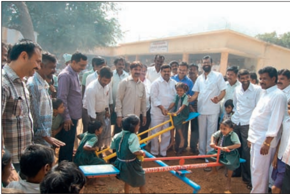
sports materials distribution