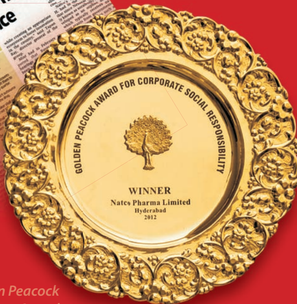
Golden Peacock Award