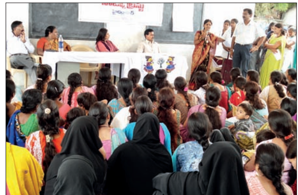
a beneficiary speaks in alumni meet