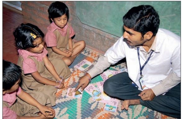
Natco pre primary school