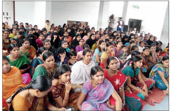
women in alumni meet