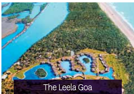
The Leela Goa