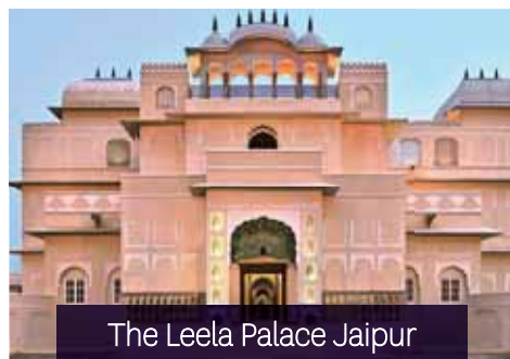
The Leela Palace Jaipur