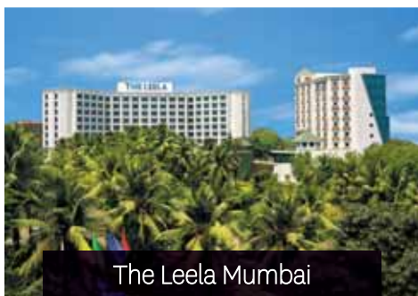
The Leela Mumbai