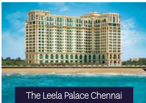
The Leela Palace Chennai