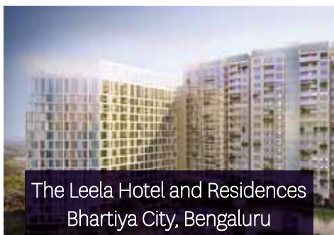
The Leela Hotel and Residences Bhartiya City, Bengaluru