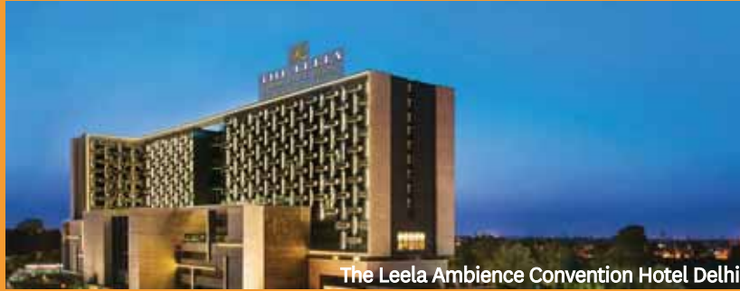
The Leela Ambience Convention Hotel Delhi

The Leela celebrates India and its myriad glories, unravels its mysteries and embraces its essence in a rare unmistakable way. It is our belief that while we embody the spectacular richness of Indian luxury, we are as much about that ephemeral richness of soul which finds expression in the warmth of the hospitality extended to each revered guest. We have continued to inculcate India's inherent grace as passionately as we have upheld an uncompromising pursuit of perfection. The hallmark of The Leela – India, Nature, Grace and Luxury, have been manifested in our initiatives, and earned us coveted accolades yet again. The Leela Palace New Delhi has ranked 3 rd amongst Asia's top 10 city hotels and also features in the world's top 100 hotels*.