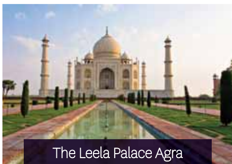
The Leela Palace Agra