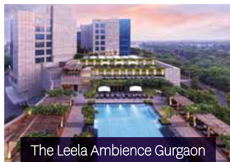
The Leela Ambience Gurgaon