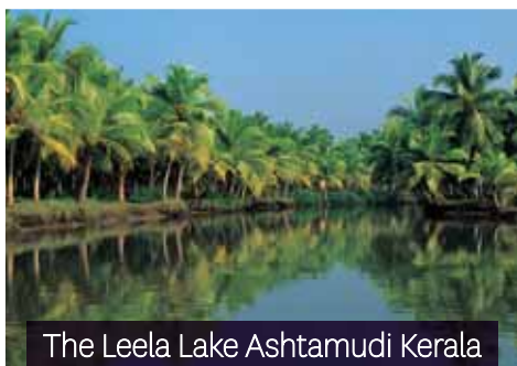
The Leela Lake Ashtamudi Kerala