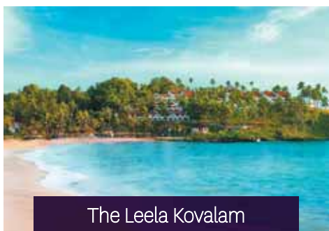
The Leela Kovalam