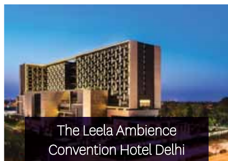
The Leela Ambience Convention Hotel Delhi