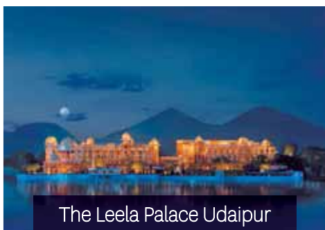
The Leela Palace Udaipur