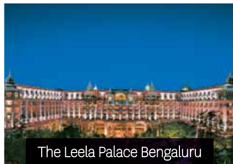
The Leela Palace Bengaluru