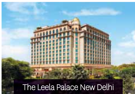
The Leela Palace New Delhi