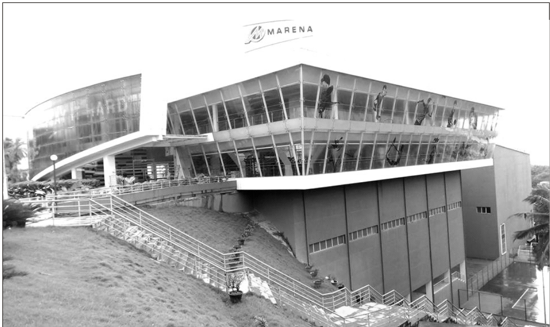
Manipal Sports Complex Building, Manipal