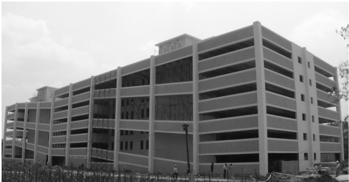
Prefabricated (Precast) MLVP for INFOSYS , MAHINDRA WORLD CITY