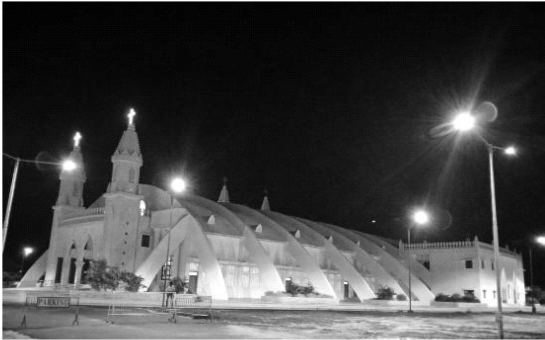
Morning Star Church for Shrine Basilica (Vailankanni Church) for Diocese of Tanjore Society