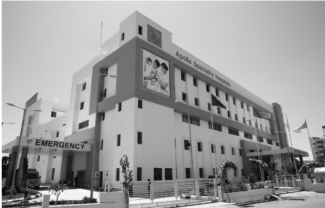
Apollo Specialty Hospital at Nellore