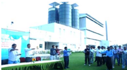
Taken Safety Oath for employees