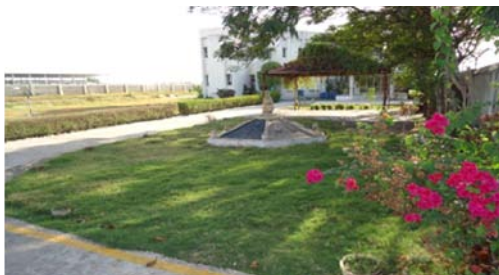
Greenery Development in Industrial area

World Environment Day is an annual event that is aimed at being the biggest and most widely celebrated global day for positive environmental action. World Environment Day activities take place all year round and climax on 5 June every year, involving everyone from everywhere.