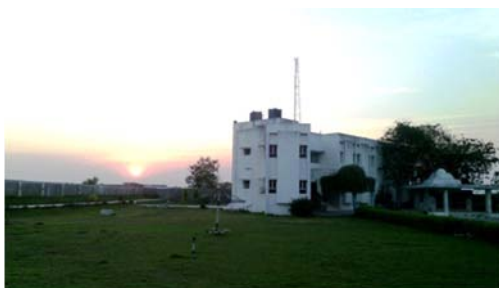
As a part of industrial land Greening Programme Annual Medical Checkup