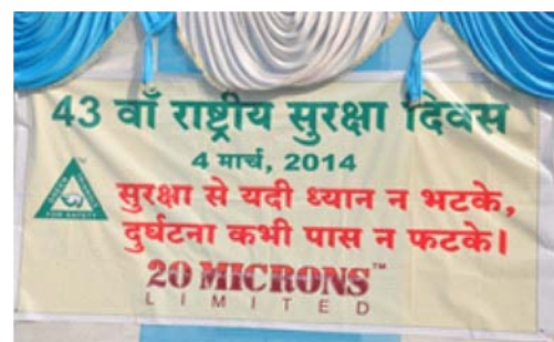
Celebrating 43 rd National Safety Day

4 th March is celebrated as a National Safety Day / Week throughout the country to increase awareness of safety in industries and their employees as well. This day is to rededicate ourselves to the cause of safety, health and environment for developing and sustaining safety culture in industrial organization.