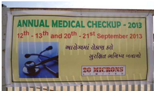
Happy to Health Prevention is Better than Cure