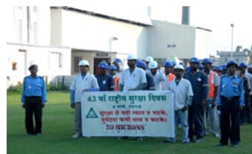
Rally for Knowledge of Safety