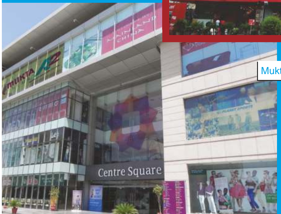
Mukta A2 Cinemas - Vadodara