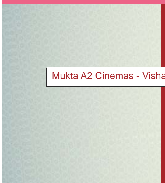
Mukta A2 Cinemas - Vishakhapatnam