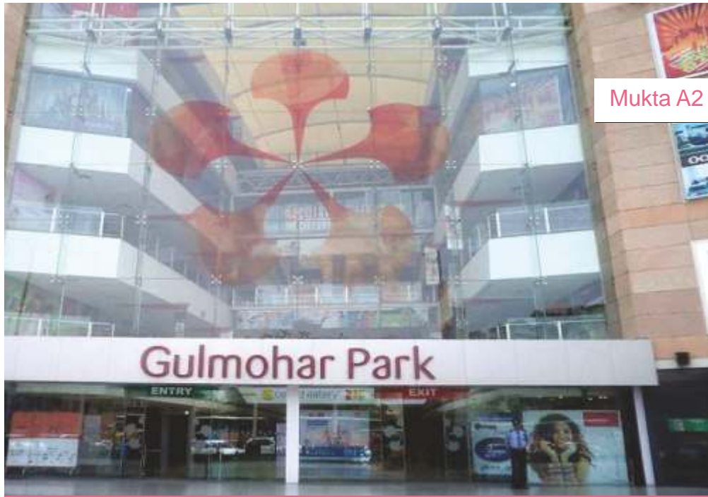
Mukta A2 Cinemas - (Ahemdabad)