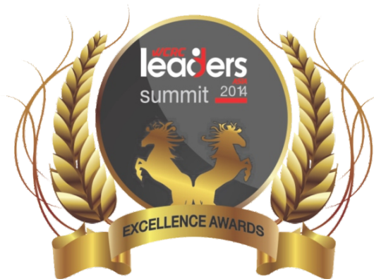
ASIS'S FASTEST GROWING MARKETING BRANDS, WCRC-204