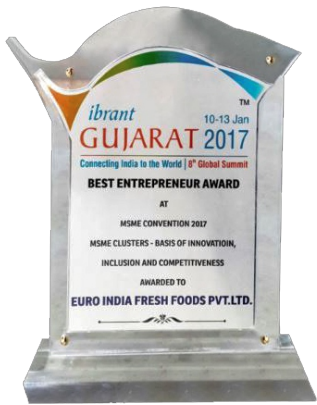
VIBRANT GUJRAT 2017 BEST ENTREPRENEUR AWARD