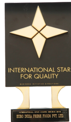
INTERNATIONAL STAR FOR QUALITY AWARD - GENEVA - 2015