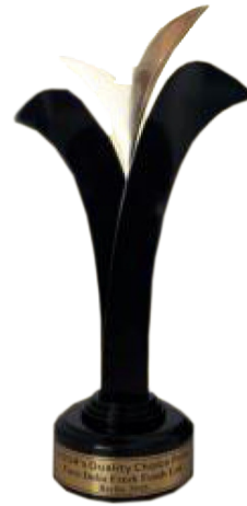
ESQR'S QUALITY CHOIC PRIZE - 2016