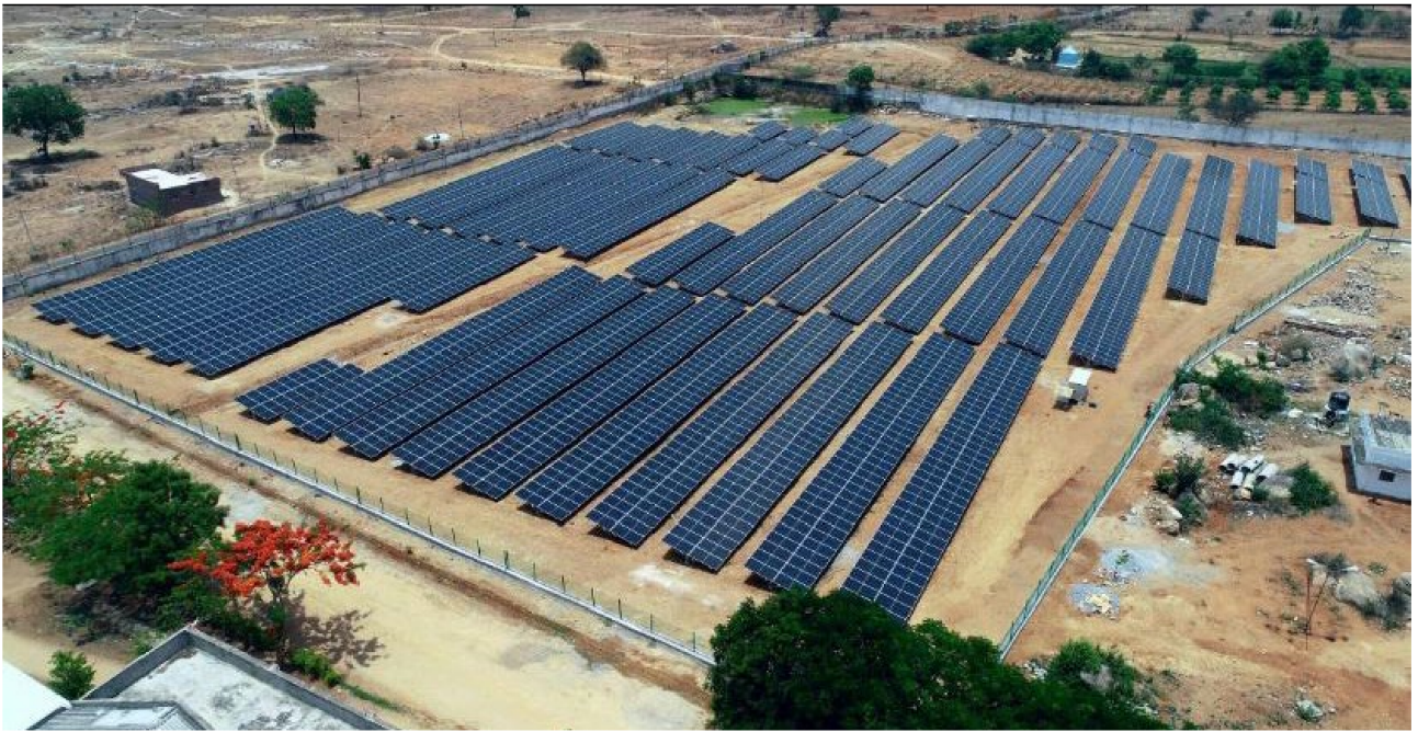
Solar power plant - Amanagallu