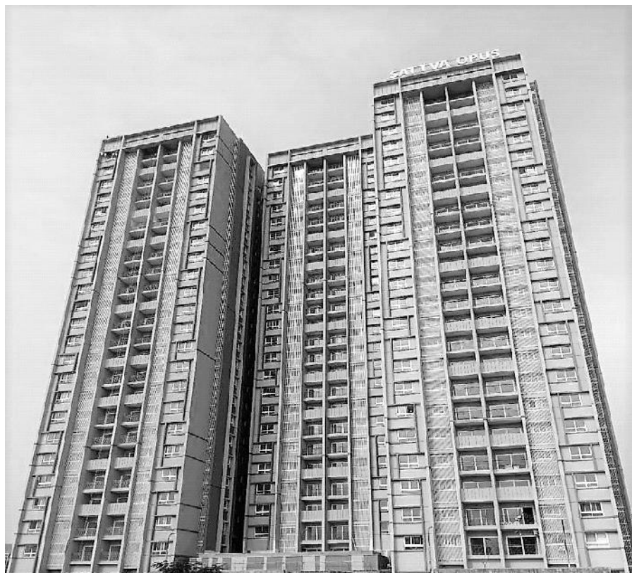
SATTVA OPUS Residential Apartments For M/S SATTVA Developers Pvt Ltd at Bengaluru, Karnataka.