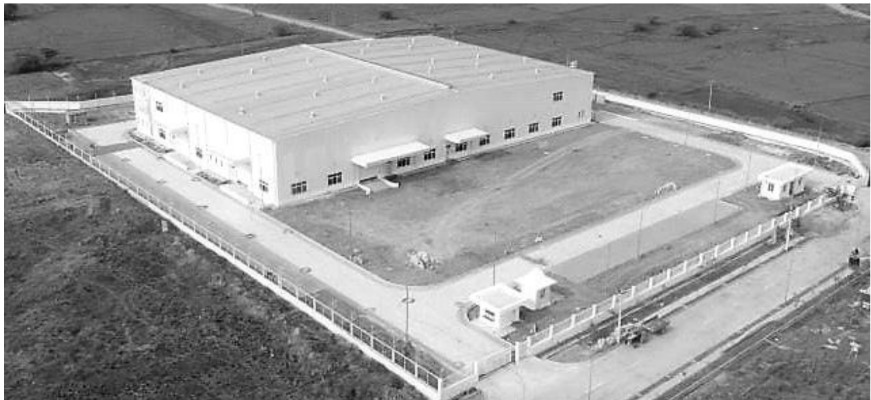
MASL Factory Building For M/s Systematic Conscom Limited at kanchipuram Near Chennai, Tamil Nadu.