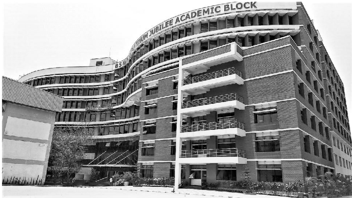
BMS College of Engineering For M/s B.M.Sreenivasaiah Educational Trust at Bengaluru, Karnataka.