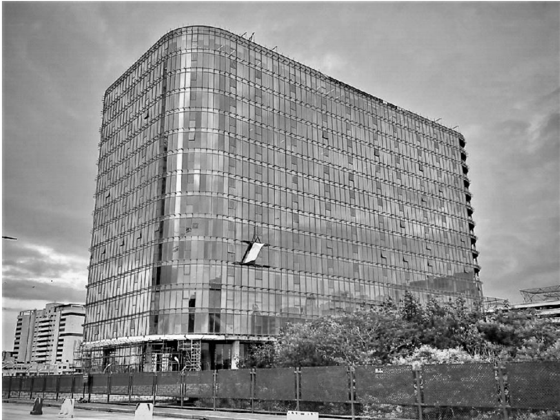
Commercial Building For M/s Karle Infra Pvt Ltd at Bengaluru, Karnataka