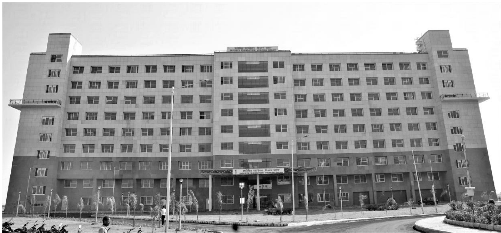
806 Bedded Vishram Sadan for Infosys Foundation At National Cancer Institute (NCI) Campus of the AIIMS, Jhajjar, Haryana

► CREATIVE ► COMMITTED ► CUSTOMER FOCUSED