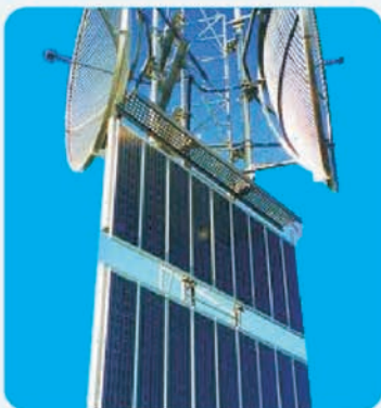
Solar Remote Communications Tower