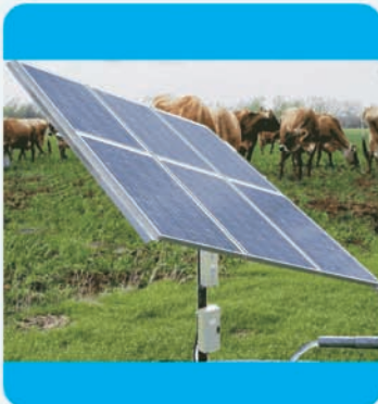
Solar Water Pump