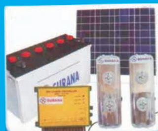
Solar Home Lighting System