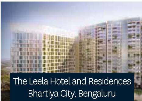
The Leela Hotel and Residences Bhartiya City, Bengaluru