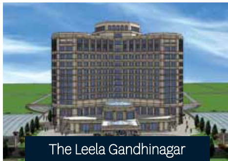
The Leela Gandhinagar