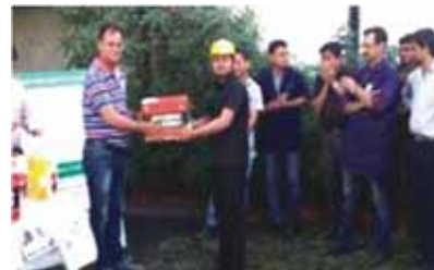
National Safety Week - Mar-4-10, 2017