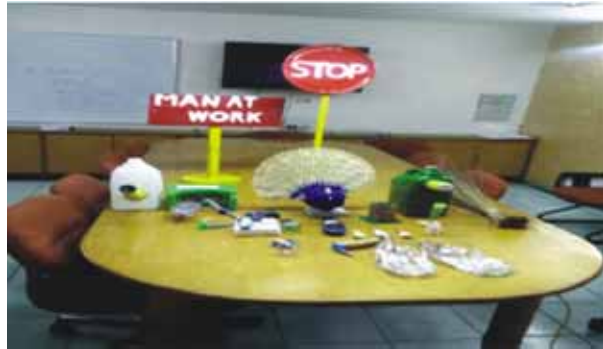
Work Environment Week - June 5-11, 2017