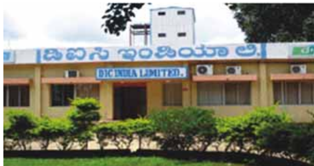
Ahmedabad Plant – Manufacturing facility for News Black