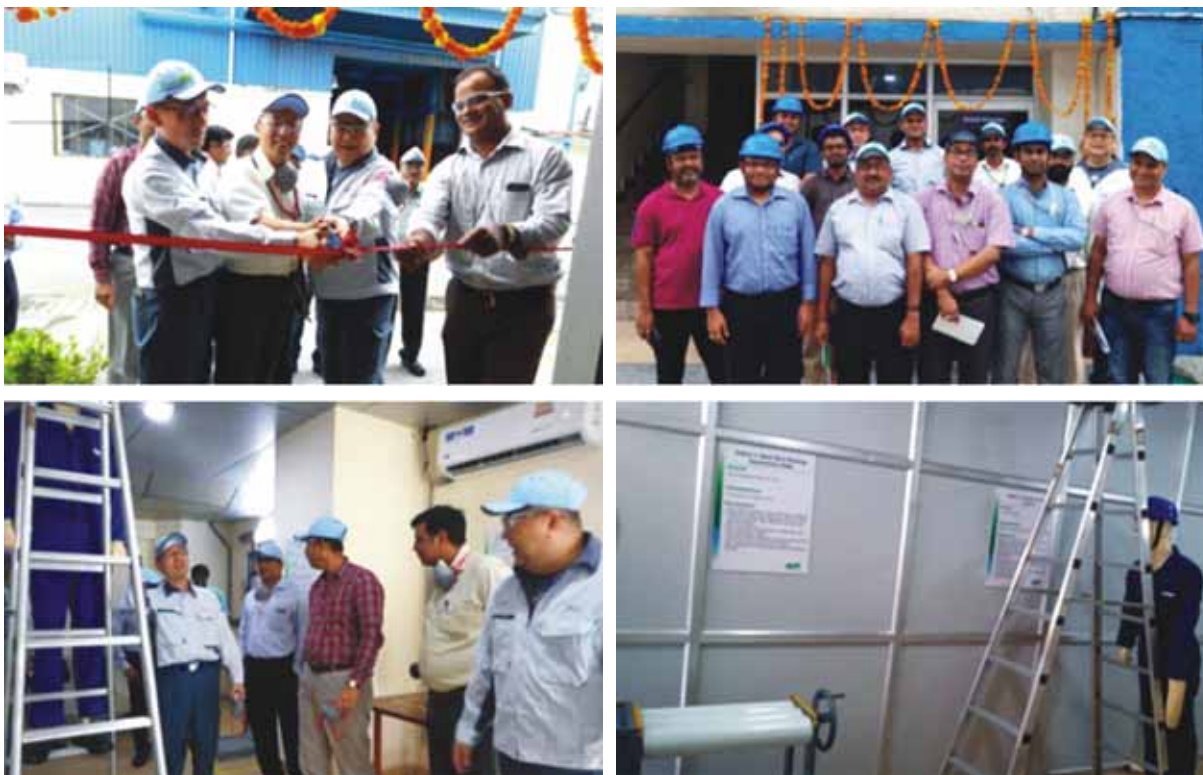
DOJO Station Inauguration & Training