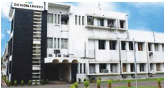
Kolkata Plant –Manufacturing facility for Liquid Inks, News Inks Black and Offset Inks