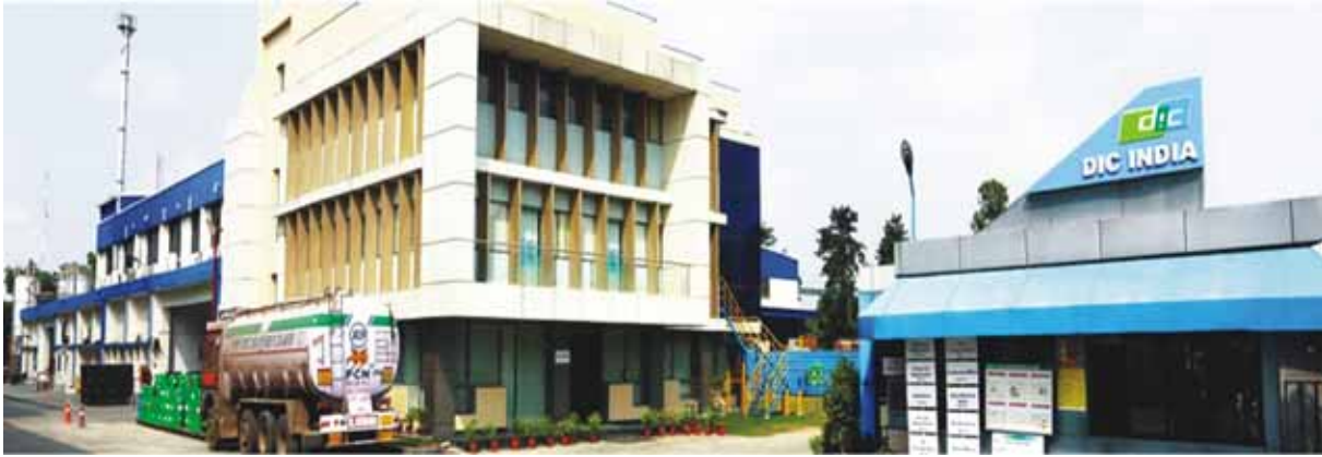
Noida Plant –Manufacturing facility for Liquid inks, News Inks Color and Flexo

DIC India has strategically established manufacturing locations throughout the Country to provide the most effective service to customers.