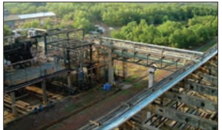
Trees planted in the Company premises