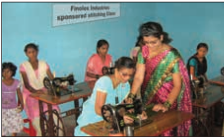
Stitching and tailoring classes for women