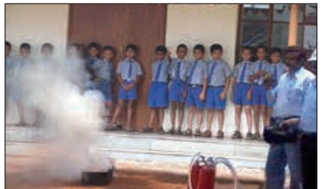
Fire fighting mock drill