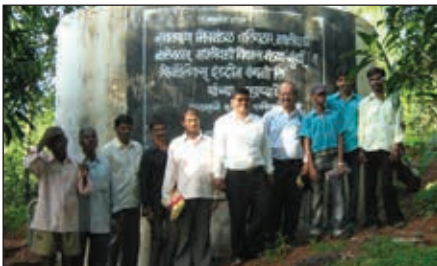
Installation of drinking water tank