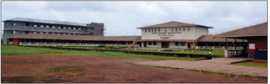
Mukul Madhav Vidyalaya