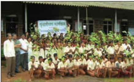
Students with tree saplings