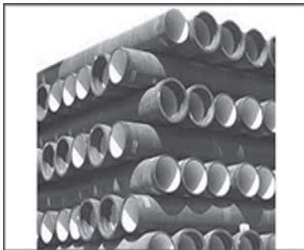
DUCTILE IRON PIPES