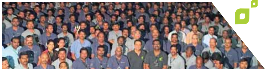
Andhra and Telangana State Teams attending Aries Futura Training Session at Vijayawada