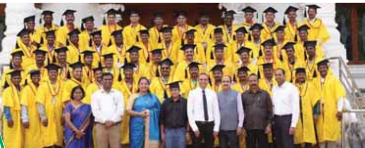
Graduation Ceremony of Aries Senior Managers who successfully completed Executive Development Program on Management and Leadership at KCT Business School, Coimbatore