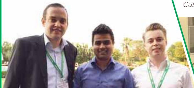
Aries Team Meeting Customers From Germany