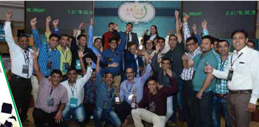
Best Sales Staff Receive their Chairman's Trophies for 2015-16