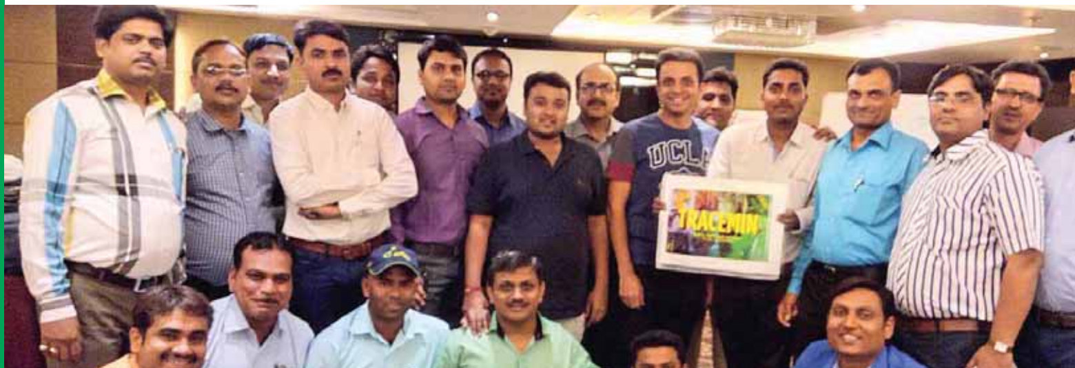
Tracemin Product Launch in Ahmedabad