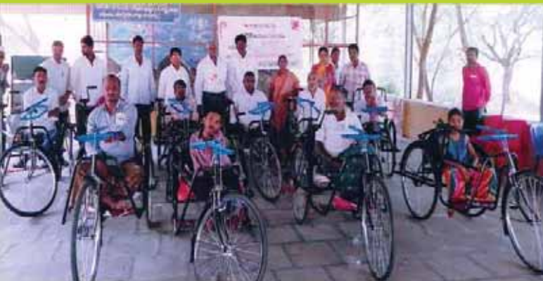
Distribution of Tricycles to the Handicapped in Guntur District, Andhra Pradesh