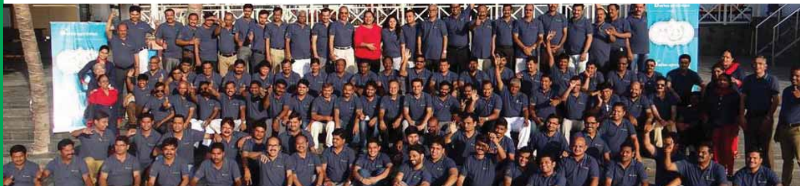
All India Strategy Meet, Daman