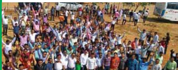
Customers Visiting Aries Factory at Hyderabad