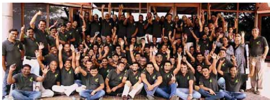
Half Yearly Review Meet, Nagpur