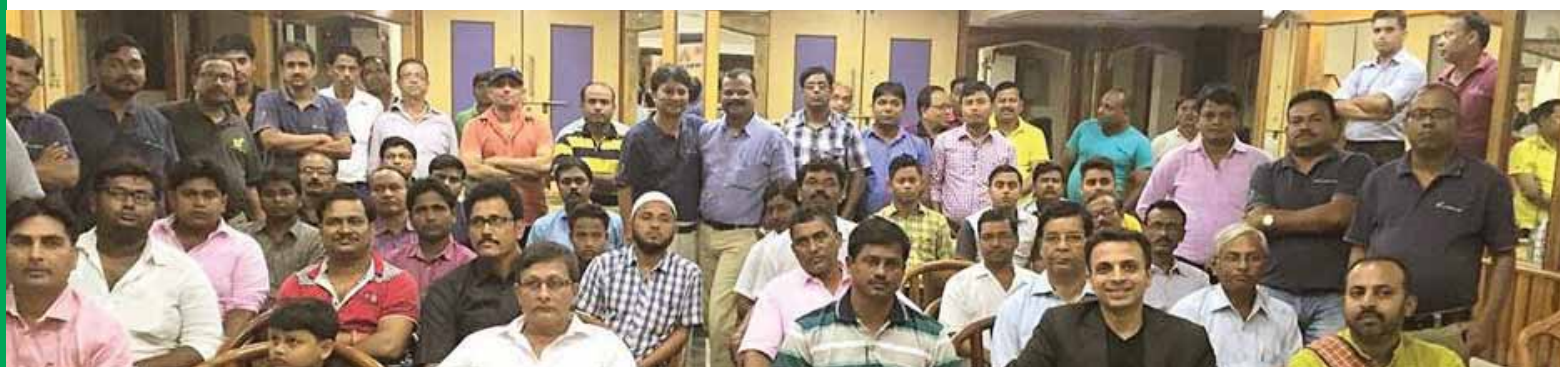
Aries Customer Convention for Eastern Region in Jaipur