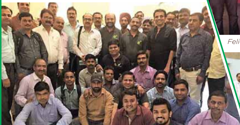
Planning Meeting with Jammu & Kashmir, Himachal Pradesh, Uttar Pradesh, Punjab & Bihar Teams at Delhi