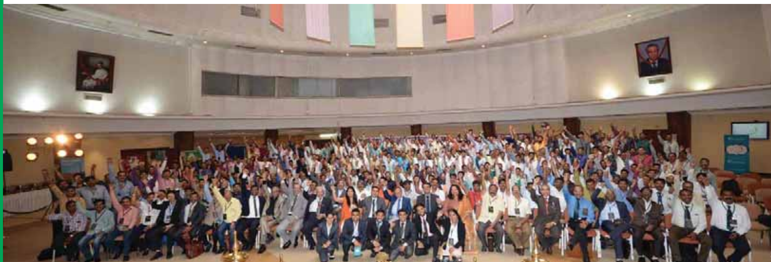
All India Director's Circle Customers attended Aries 2020 Campaign Launch at Bombay Stock Exchange, Mumbai