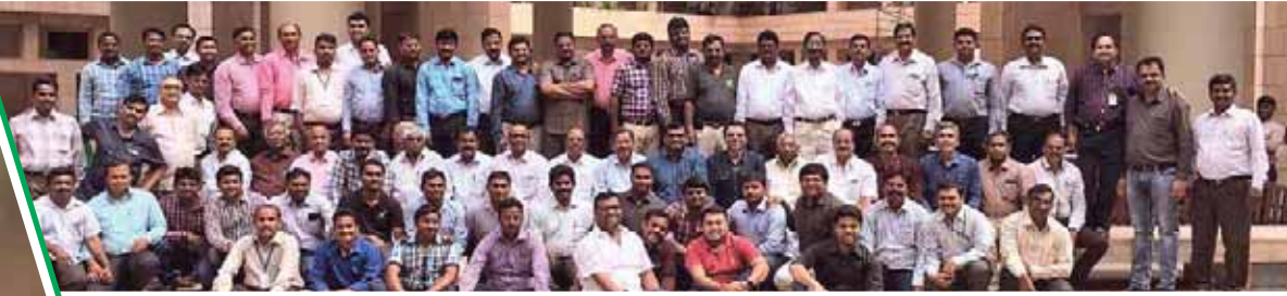
Planning Meeting with Andhra Pradesh team at ISB, Hyderabad