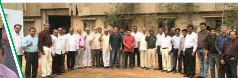
Aries Andhra Pradesh Marketing Agency Team at Hyderabad Factory