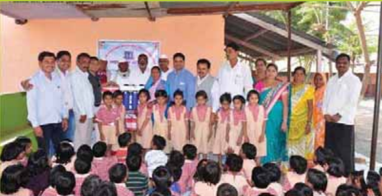
Distribution of Water Purifier to a School by Aries Nashik Team