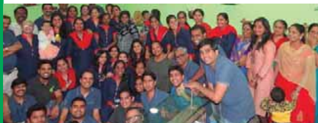
Family Day at Aries Corporate Office, Mumbai