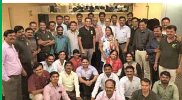
Planning Meeting with Maharashtra & Nipani Teams at Mumbai