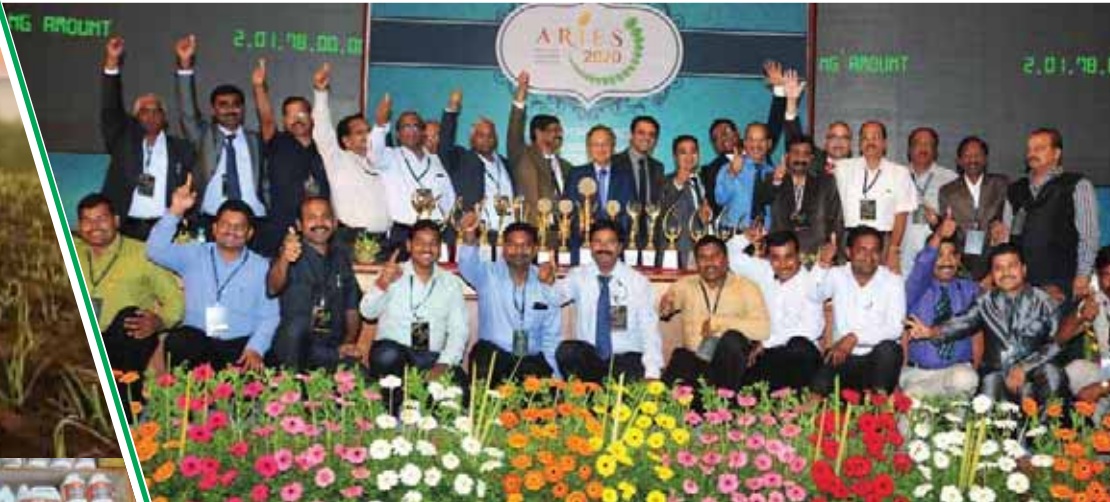
Best Marketing teams of Aries Receive their Chairman's Trophies for 2015-16