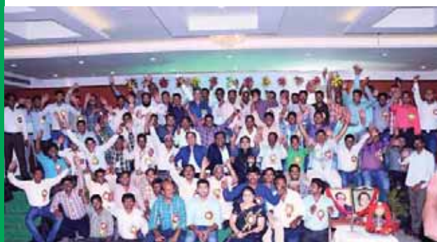
Aries Flash Sale and Customer Convention for Andhra Pradesh Dealers