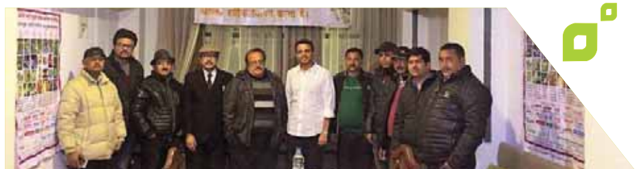
Apple Growers Meet at Himachal Pradesh