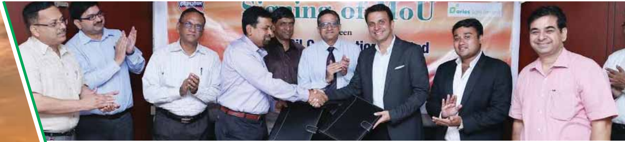
Signing of MOU with Indian Oil Retail