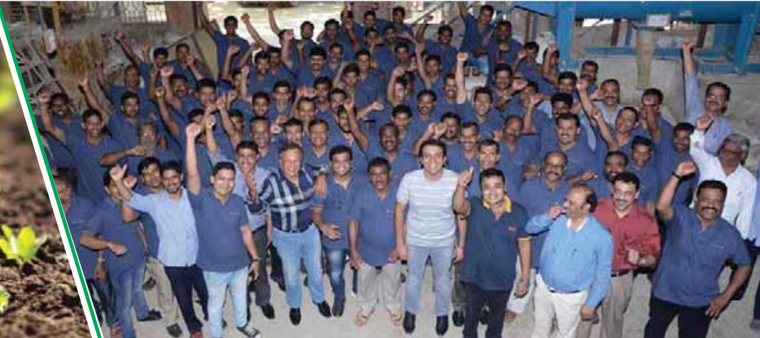
Aries Factory Staff and Workers at Mumbai