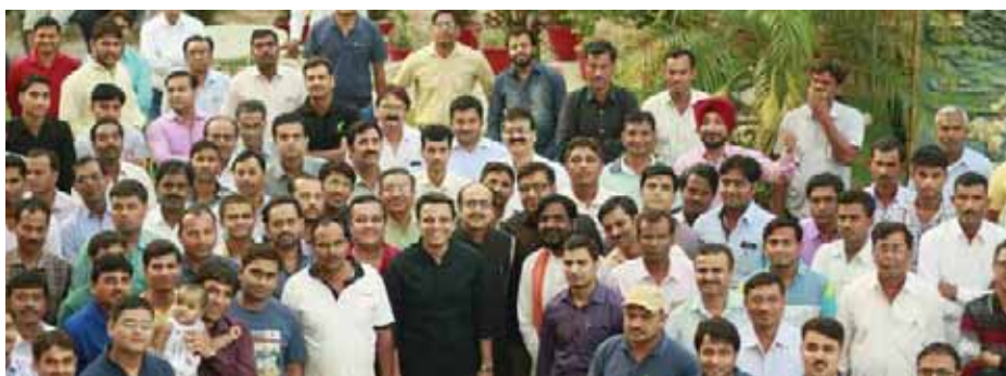
Aries Flash Sale And Customer Convention for East UP, Bihar, Rajasthan, Gujarat, Haryana & Chattisgarh at Haridwar