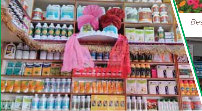
Aries Display Contest held in Nashik Region