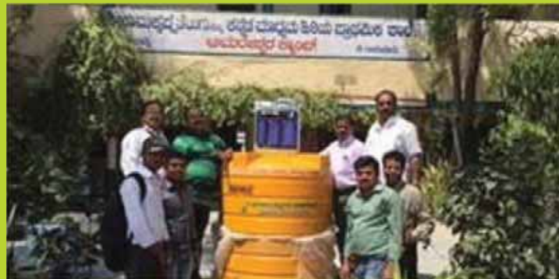
Installation of Water Storage Tanks in Bellary, Karnataka