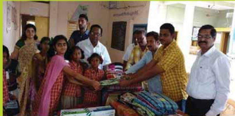
Aries Telangana Team Distributing Cots, Pillows and Bedsheets under Infrastructure Support in Khammam District, Telangana