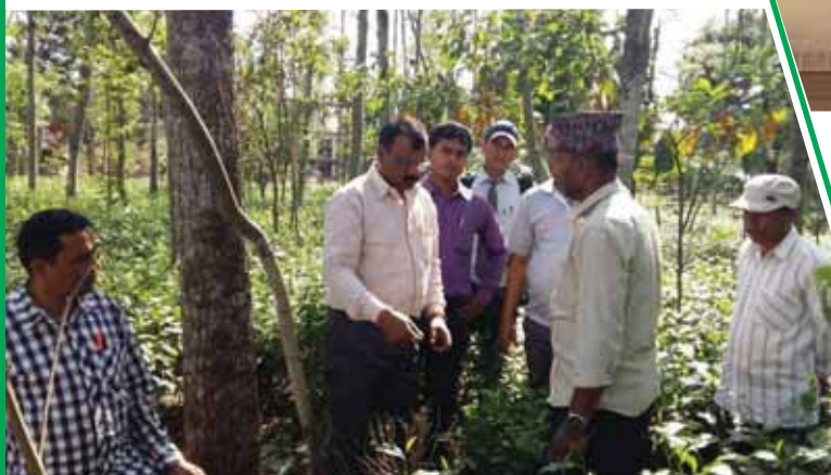
Aries Extension Team Visiting Fields in Nepal