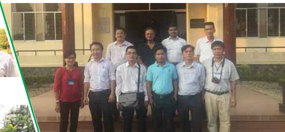
Aries International Business Team Visited Southern Horticulture Research Institute In Vietnam