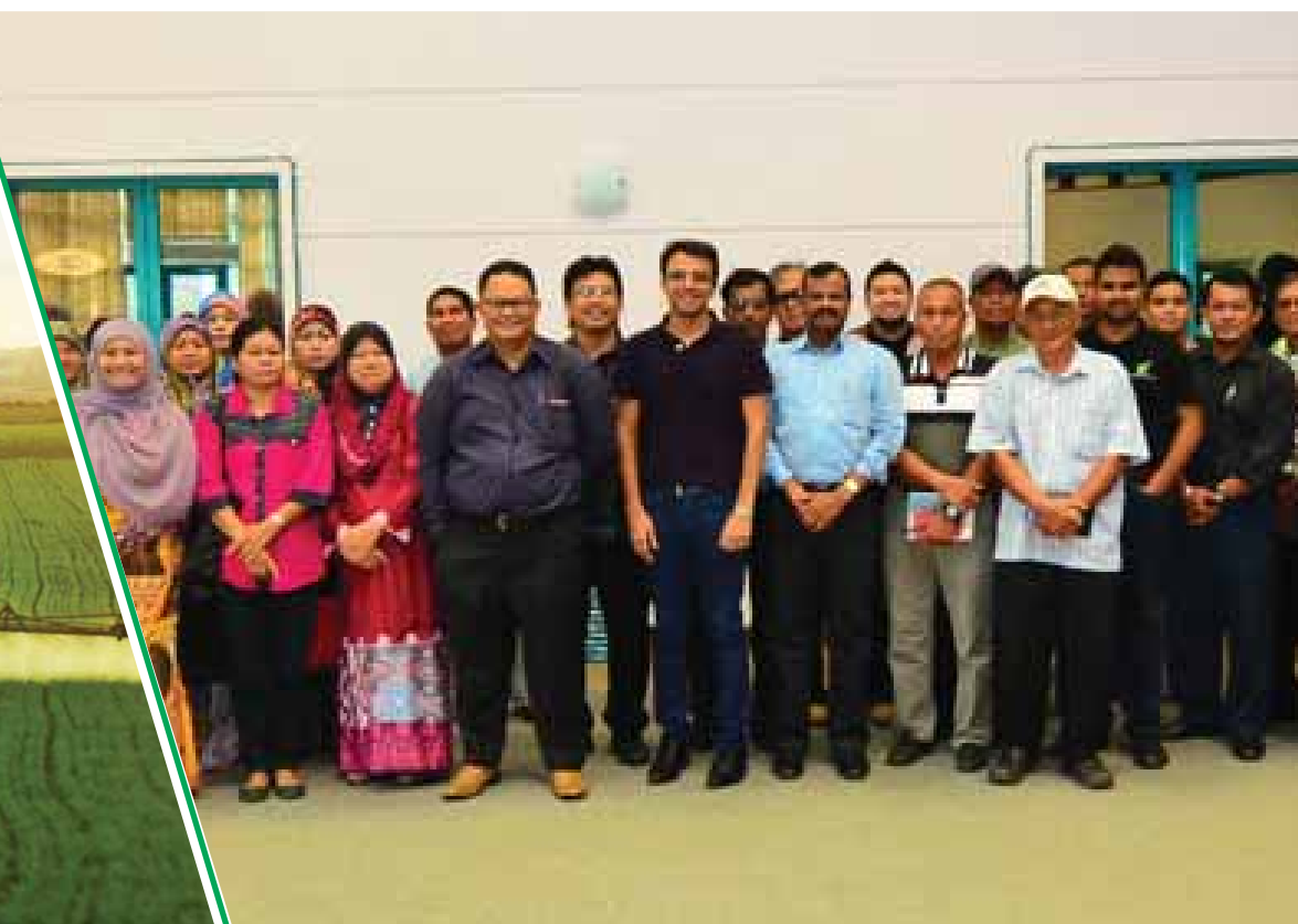
Customers & Farmers visit in Brunei