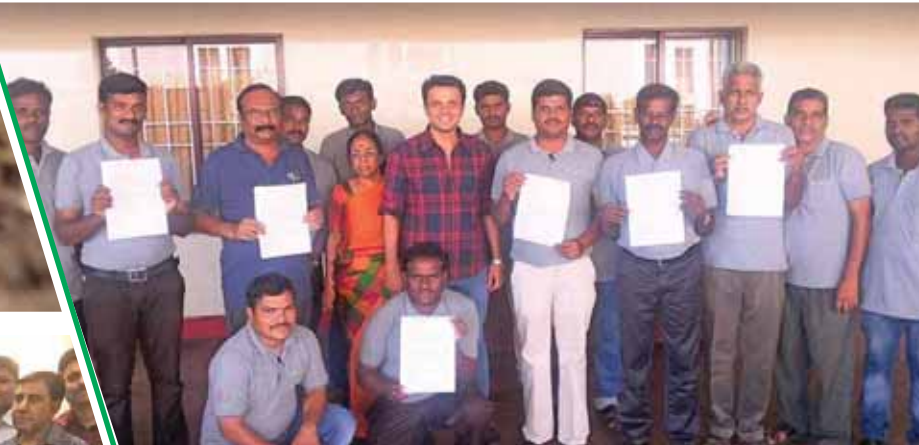
Felicitation of Aries Southern Team at Bengaluru