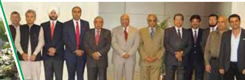
Customer visit in Pakistan