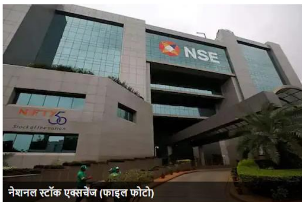
नेशनल स्टॉक एक्सचेंज (फाइल फोटो)

चालू वित्त वर्ष 2021-22 में एनएसई में अब तक पचास लाख से ज्यादा नए निवेशकों ने रजिस्ट्रेशन किया है.